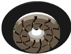
2" Cup Wheel