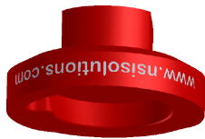
5/8 –11 Thread Adapter